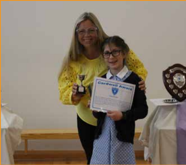
FCJ Cardwell Cup: Ruby