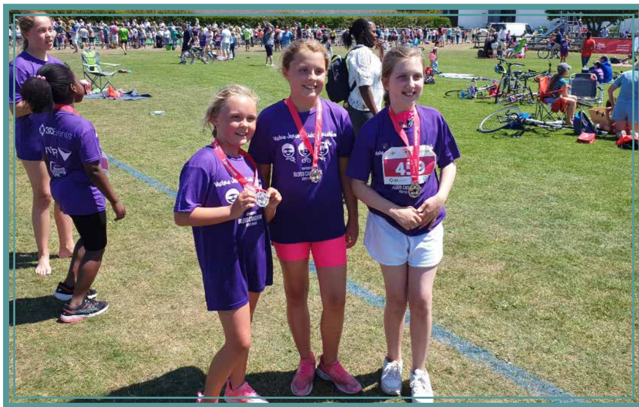
Year 4 & 5 Triathlon Girls

The Vistra Bloodwise Jersey Kids' Triathlon is now in its 9th year and took place on Saturday 12 June 2021 at Les Quennevais Sports and Leisure Centre.