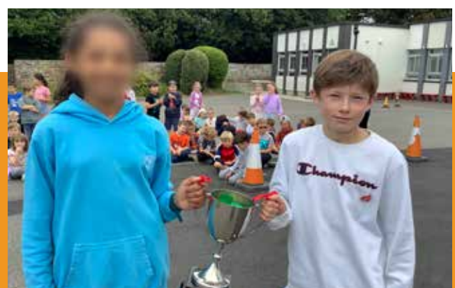
FCJ End of Year House Cup & PSA Inter House Sport Cup: St. Helier