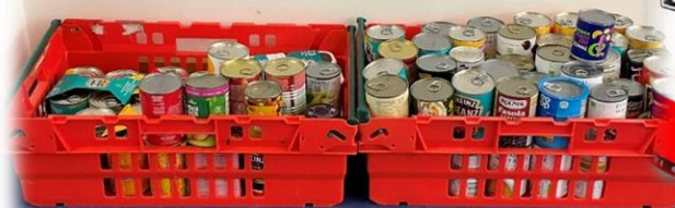
Donations for The Shelter Trust's Tinathon.